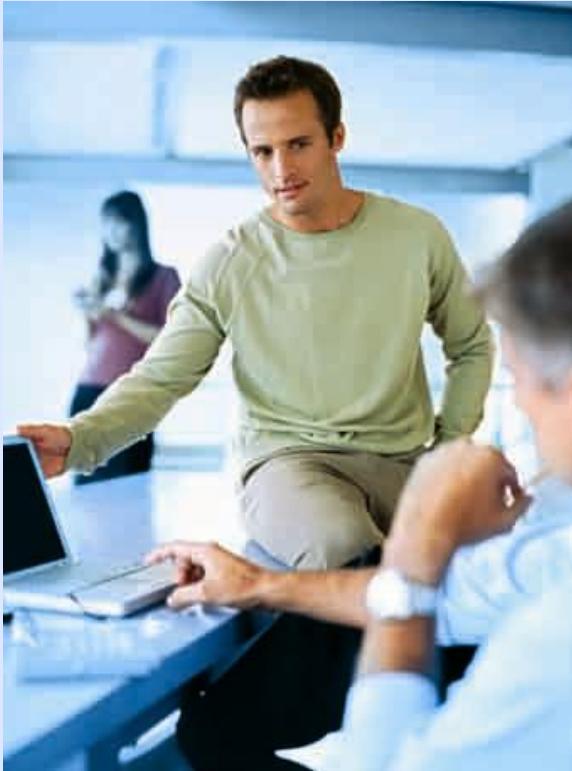
Number of starters increases